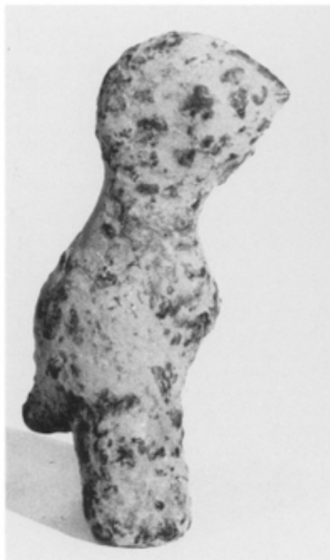
◀ OPPOSITE PAGE 7. MBOLE FIGURINE USED BY LILWA SOCIETY TO REPRESENT AN OFFENDER AGAINST SOCIETY. 60cm. WELLCOME COLLECTION, UCLA MUSEUM OF CULTURAL HISTORY

All peoples in this area speak Bantu languages. Linguistically, however, they represent various subdivisions within the Bantu languages. According to Guthrie (1967, 1970), who has synthesized a great