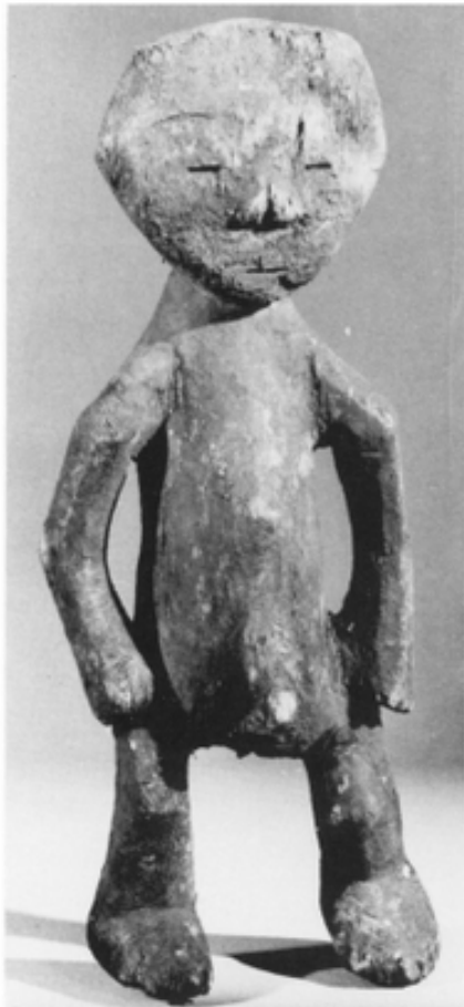
10. YELA FIGURINE, 40cm.