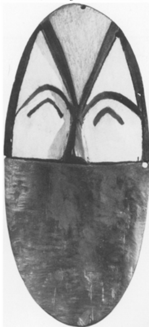
ABOVE: 5. MBOLE MASK, 45.9cm. MUSEE ROYAL DE L'AFRIQUE CENTRALE. LEFT: 6. PERE DOUBLE FIGURINE, 21cm. MUSEE ROYAL DE L'AFRIQUE CENTRALE.

In the existing literature on African art, little justice has been done to this vast region. The main emphasis has been on Lega, and occasionally on some of the other groups, especially Mbole. In general, the information provided is scanty and incomplete. Early works on the art of Zaïre, by Coart and de Hauleville (1906) and Maes (1935; 1938) have practically no information on the area. Maes (1935, pl. XVI) makes a hopeless confusion, ascribing to the Bemba and the