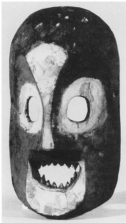
12. KOMO MASK, 33.2cm. MUSEE ROYAL DE L'AFRIQUE CENTRALE