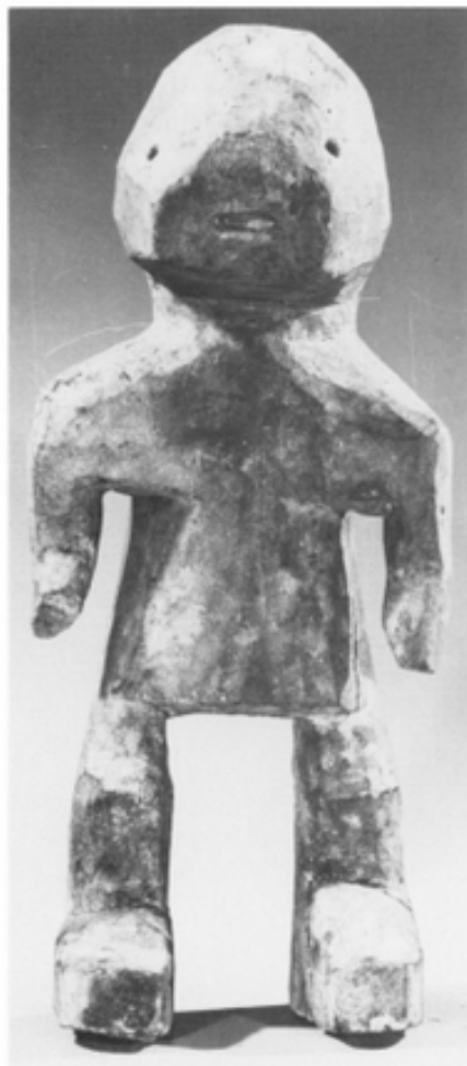
4. MBOLE FIGURINE, 41cm. MUSEE ROYAL DE L'AFRIQUE CENTRALE.

derive some of their art forms from them (Nyanga, Kwame, Hunde, Longola). Large figurines in wood are known among the Mbole, Lengola, Mitoko, Komo, and Kasingo, Zyoba, and Boyo. There is much work in wood of intermediate size among the Yela, Pere, Lega, Lega, and Bembe. The Mitoko carve tall notched poles adorned with a head or face. Among the taller figurines, there is a preference for slender figures among the Mbole, Lengola, and Komo, and for the heavier, more stocky ones among the Kasingo and Boyo; but groups like the Mitoko have both types.