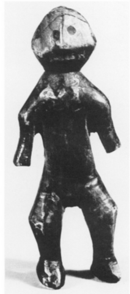
ABOVE: 13. LEGA FIGURINE IN IVORY, 14cm. COLLECTED BEFORE 1934. MUSEE ROYAL DE L'AFRIQUE CENTRALE. LEFT: 14. PERE MINIATURE STOOL IN CLAY, 7.8cm. MUSEE ROYAL DE L'AFRIQUE CENTRALE.