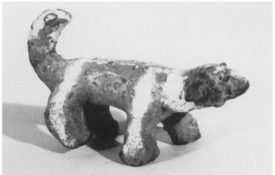
11. PERE ANIMAL FIGURINE, 13.5cm. MUSEE ROYAL DE L'AFRIQUE CENTRALE