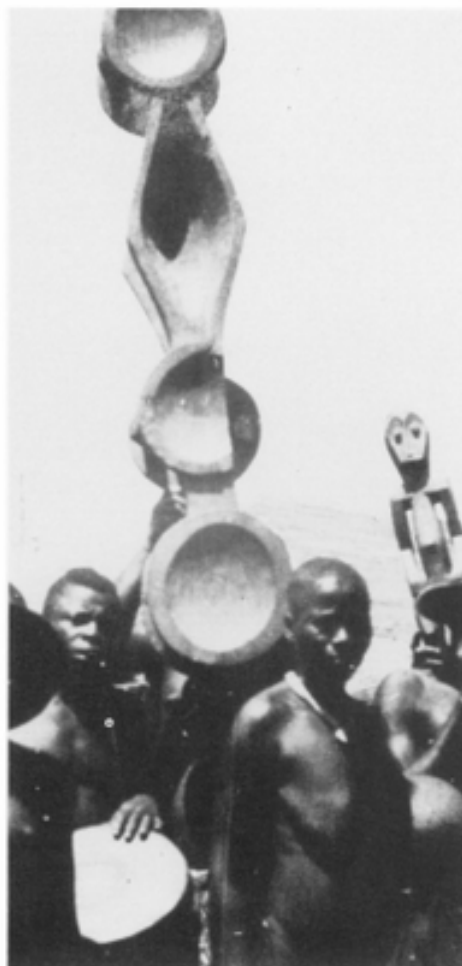
OPPOSITE PAGE: 3. ANCESTOR FIGURINE IN KASINGO STYLE, 49cm. MUSEUM OF CULTURAL HISTORY, UNIVERSITY OF CALIFORNIA, LOS ANGELES.