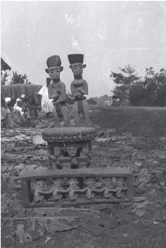
12. Unidentified artists Two-figure seat (ca. 1929) Musée des arts et traditions, Foumban, Cameroon