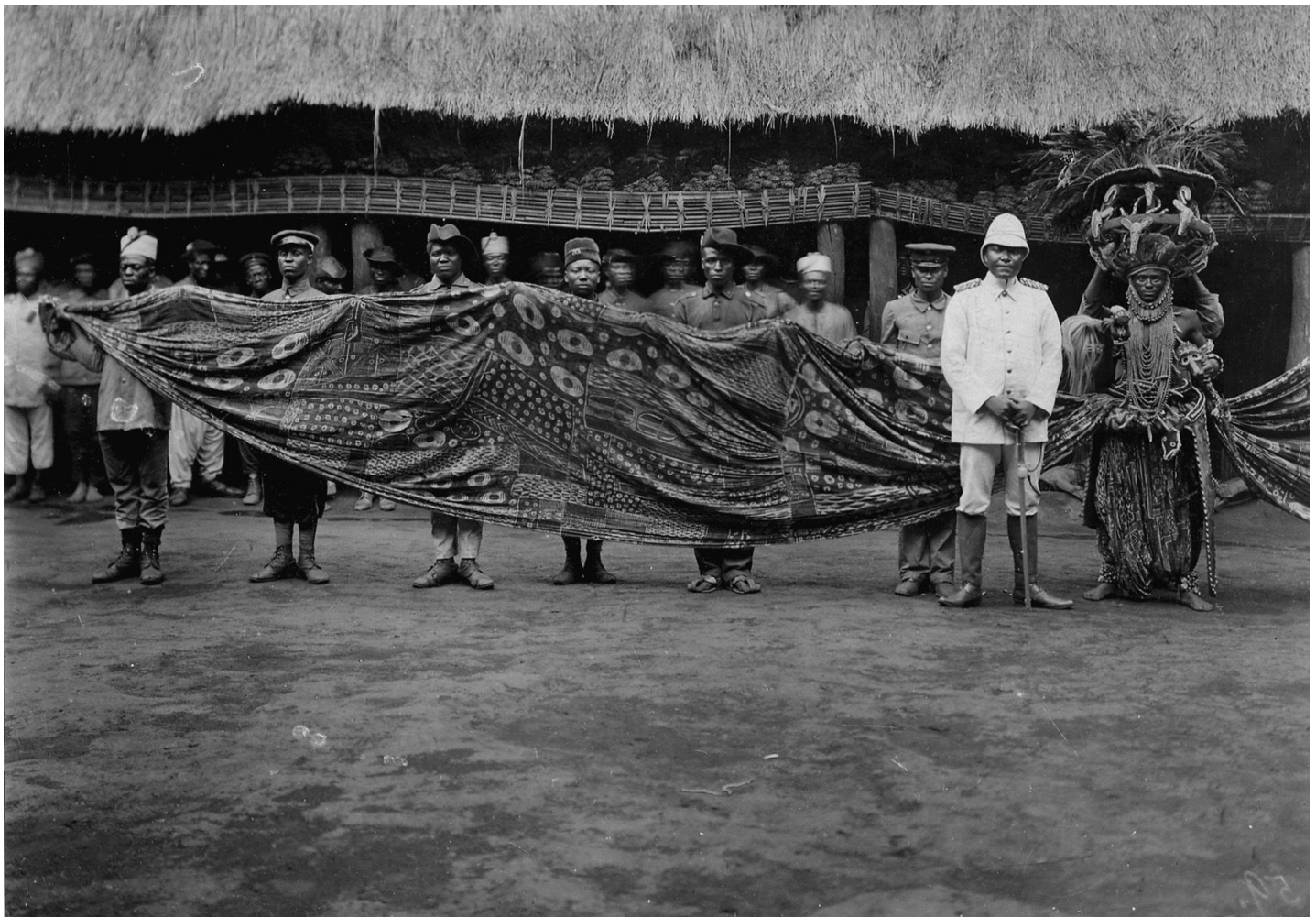
15 Bernhard Ankermann Tanzkleid des Königs, rechte Hälfte (1908) Black and white positive VIII A 5331, Staatliche Museen zu Berlin– Ethnologisches Museum

Indeed, today the artisanat of Foumban is known not only for making contemporary objects that resemble older Bamum works of art but for its astonishing range of objects that appear like art from other parts of Africa. Cast brass heads in the style of works from the Benin kingdom, masks that resemble works from Igboland, figures covered with nails, like those from Congo, and new inventions, such as huge brass figures called "Tikar" are all made in workshops in and around the Bamum capital. Such production, one may contend, represents a logical extension