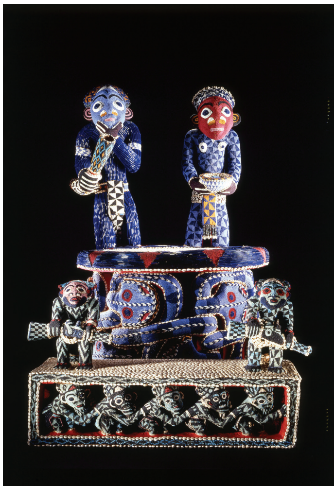
14 Unidentified artists Two-figure throne and footrest ( mandu yenu ), second half of the 19th century Wood, glass beads, cowrie shells, cloth; 174 cm x 126 cm x 155 cm III C 33341 a, b, Ethnologisches Museum, Staatliche Museen zu Berlin

themselves were an intended audience. They chose to ignore the strong probability that the “natives” were managing them, shaping their beliefs about the events and the objects in circulation around them. The artifice of the festivities, for the foreign visitors, lay in reenacting rituals to convince Bamum audiences that the masquerades and dances (and the objects associated with them) were powerless and ineffective, not in making the foreigners believe that the rituals and objects were “real.”