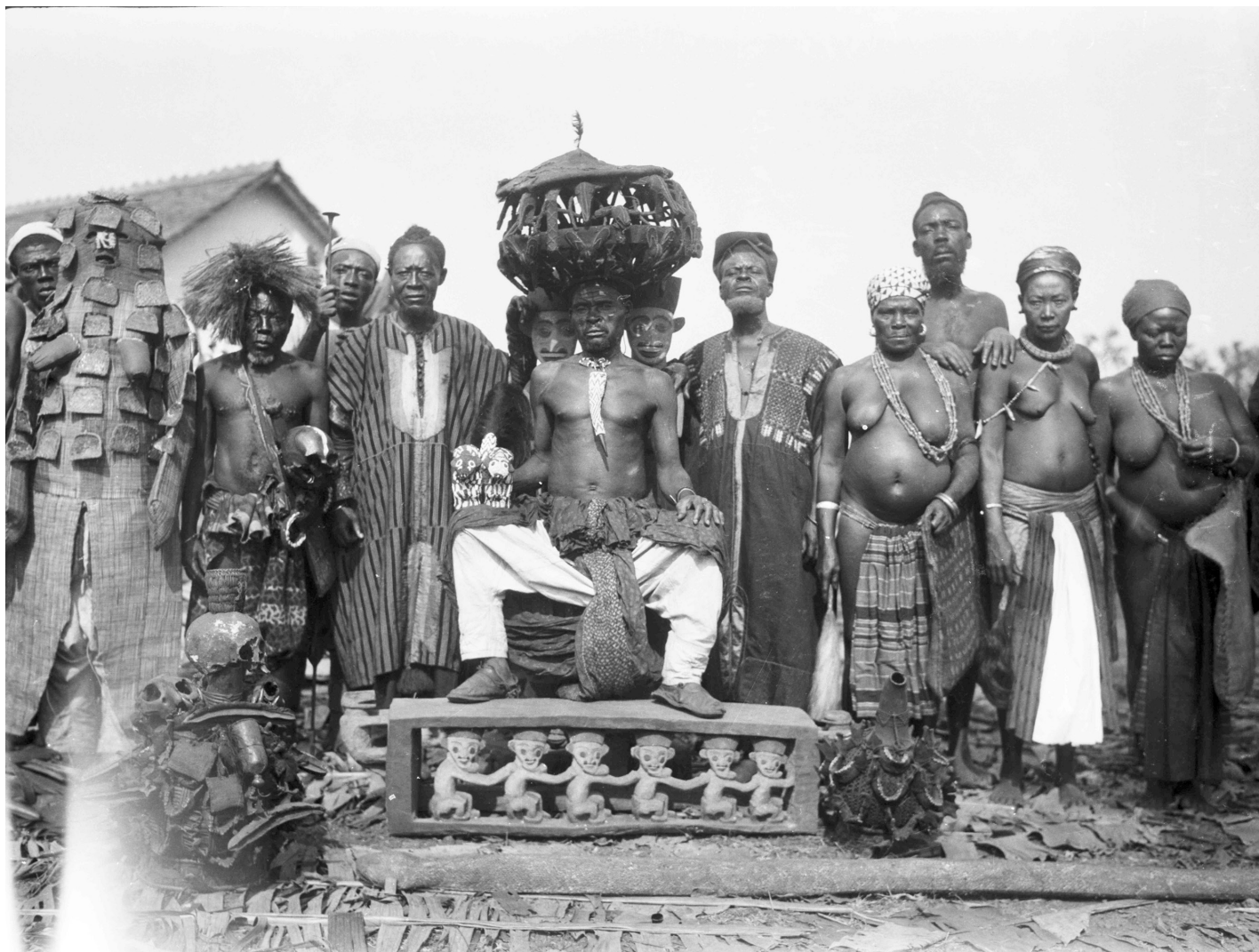
13 Bamum Chief, on Sculpted Throne, with Supporters (1929) Positive scan of nitrate negative 2004.24.8451