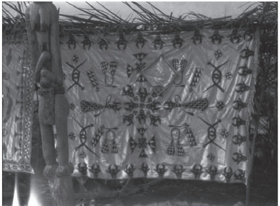
4 Advertisement for the artisanat of Fomban, Journal officiel des territoires occupés de l'ancien Cameroun , April 1927 (236):227.

Just as crucially, during the 1920s the French administration that replaced the German colonial authorities sidelined King Njoya, reducing his power, authority, and resources and suppressing much of the visual culture of the Bamum monarchy.