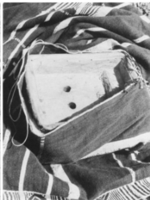
THE HOOD IS SEWN TO THE BACK OF THE MASK WITH A THREAD MADE FROM THE VEINS OF PALM LEAVES.