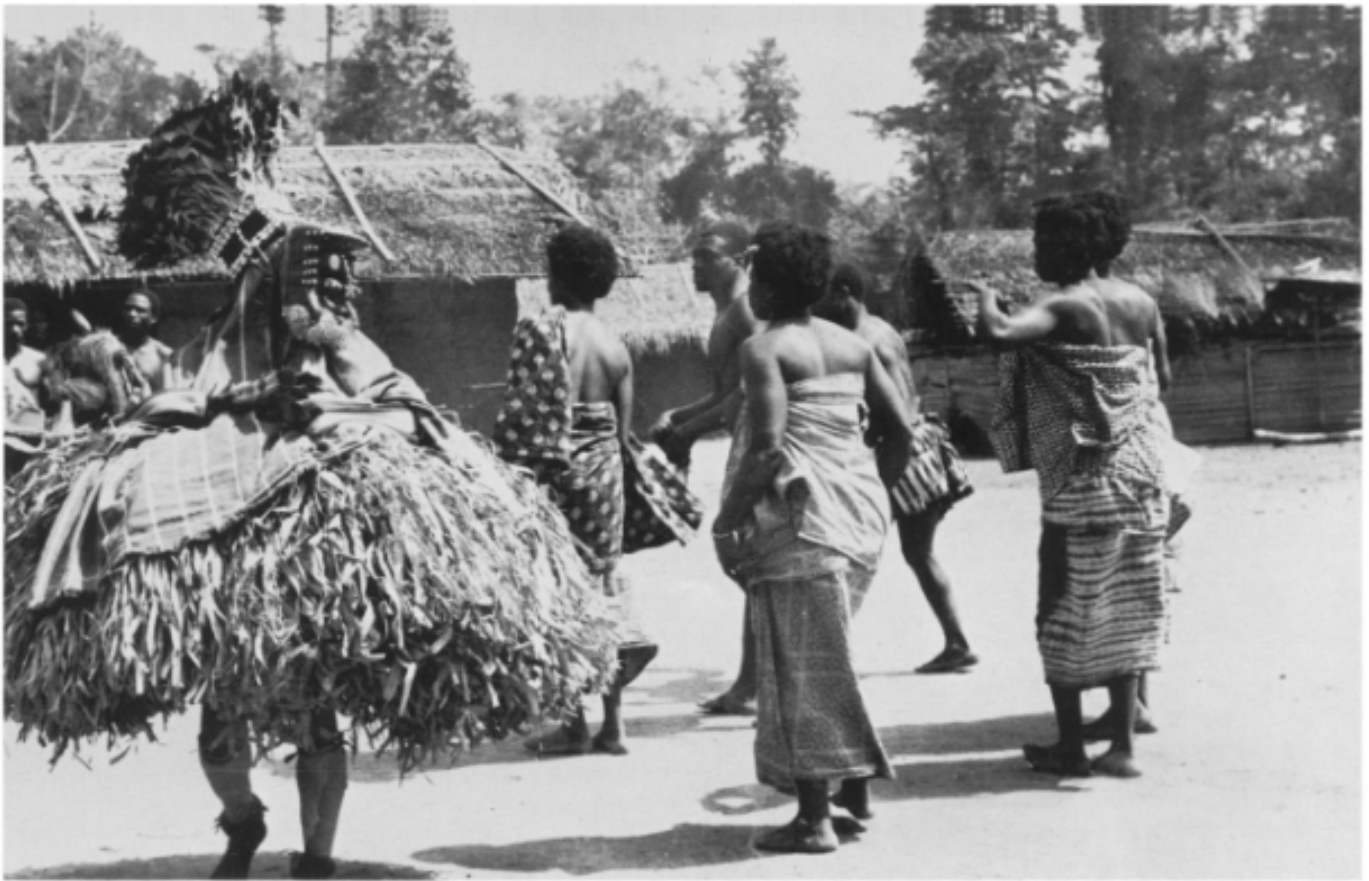
BÉTÉ MASKS ARE OFTEN CALLED UPON TO OFFICIATE AT THE FUNERALS OF IMPORTANT MEN. AFTER THE INTERMENT THE MASK WILL ENCOURAGE THE WIDOWS TO PUBLICLY OVERCOME THEIR GRIEF BY DANCING WITH IT BEFORE THE ASSEMBLED VILLAGERS.

village, without whose authority it may not be disturbed.