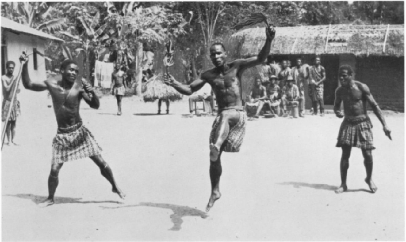
A GROUP OF ACRBATIC DANCERS, CARRYING THE CEREMONIAL PROPS OF THE MASK, ASSIST THE MASKED DANCER AND HELP PROTECT HIM FROM ALIEN FORCES.

those who might have wandered out of the village and entertaining the early arrivals. In the house, the dancers and their assistants gathered for the final ritual dressing of the mask.