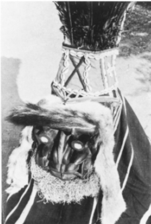
THE HEAD ENSEMBLE IS SECURED BY CLOTH STRIPS WHICH PASS FROM THE SIDES OF THE HEADDRESS UNDER THE LOWER JAW OF THE MASK.