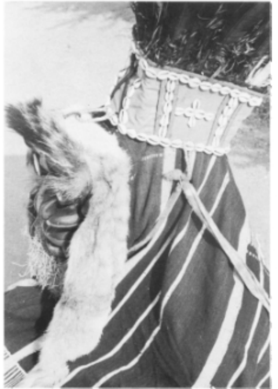
THE COLORFUL HEADDRESS IS PLACED ON TOP OF THE HEAD, OVER THE HOOD, AND HOOKED TO THE TOP OF THE MASK.