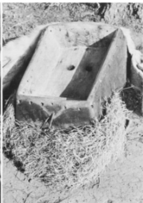
THE POSTERIOR EDGES OF THE MASK ARE PERFORATED WITH SMALL HOLES FOR THE ATTACHMENT OF THE CLOTH HOOD.