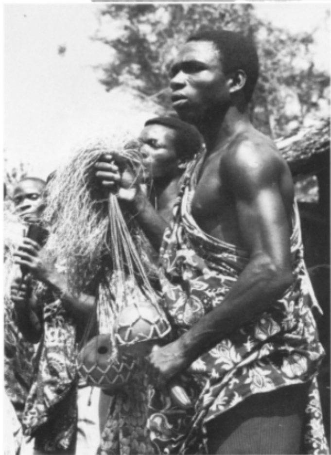
THE ORCHESTRA IS COMPOSED OF FOUR DRUMMERS AND A CHORUS OF SINGERS, SOME OF WHOM ARE SEEN HERE AND ABOVE PLAYING DRUMS, BEADED CALABASHES, AND A METAL BELL-SHAPED CLACKER.

Sitting in the glow of that lantern, surrounded by the laughter of children and the warm greetings of the old men, I felt suddenly far removed from the toils of African life. The night blended the forest with the earth and sky, isolating the cluster of mud-on-bamboo houses into a friendly concentration of light and sound in which house-keeping, farming, marketing, and latrine-digging seemed to have no place.