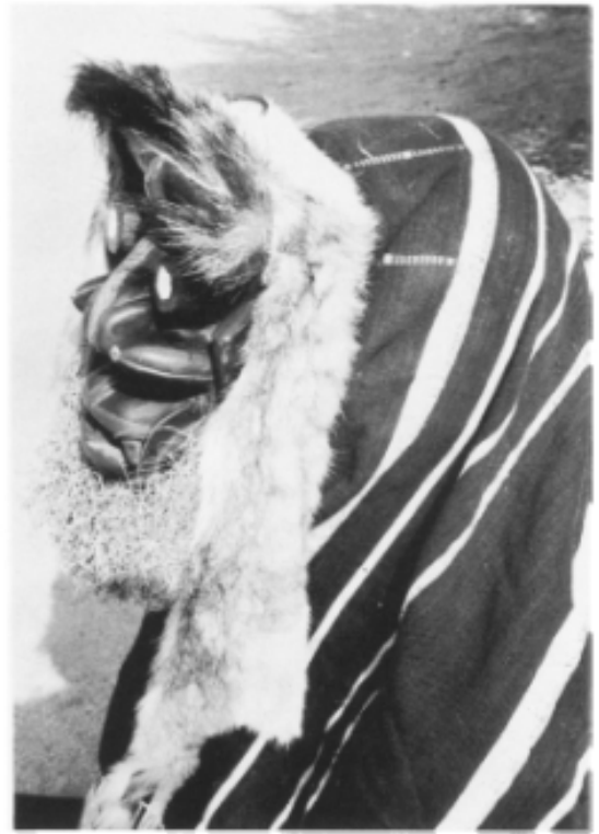
THE HOOKS PLACED ON TOP OF MANY BÊTE MASKS SERVE AS A POINT OF ATTACHMENT FOR THE HEADDRESS.