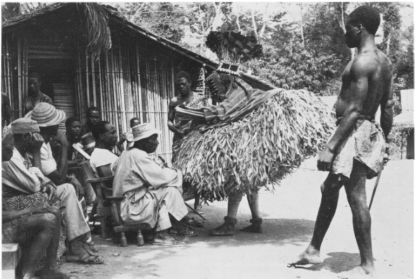
IN THE COURSE OF HIS DANCE, THE MASK WILL PAUSE TO GREET THE NOTABLES OF THE VILLAGE. ONE OF WHOM IS SEEN SEATED UPON THE TRADITIONAL LOW, ROUND-BACKED STOOL.

In the region around Daloa, Bété masks are generally classified into three functional categories. At the head is the extraordinarily impressive Great Mask, which is rarely used today. It is the repository of the accumulated spiritual forces of the village, protecting the community in times of trouble and serving as an intermediary between earth and Kuduo , the City of the Dead. No village will possess more than one of these formidable objects, and many have none at all. Where it can still be found, it is closely guarded and its use is carefully controlled by an old woman of the