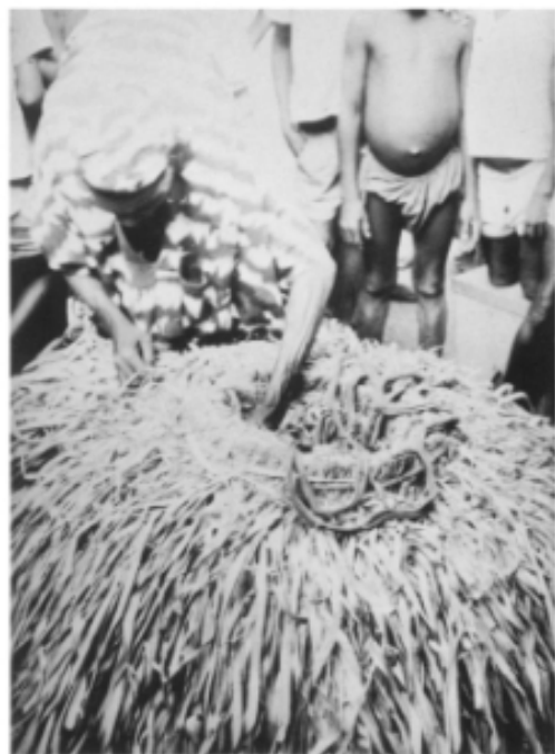
A RAFFIA SKIRT, MEASURING AS LONG AS THIRTY FEET WHEN UNROLLED, IS WORN BY THE MASKED DANCER.

Inside the house the mask itself was brought out and its assembly was begun. A woven, blue and white cloth was carefully stitched around the entire posterior edge of the mask, forming a hood which would completely cover the head, shoulders, and upper arms of the wearer. When this phase of the operation was completed, the musicians took their leave, adjourning to the open area by the road where they began warming up, calling with their drums